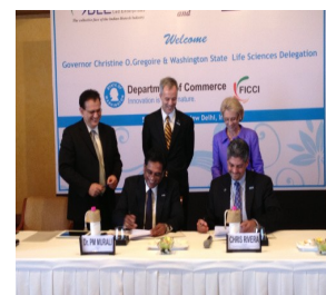
Delegation Presentation in India

Washington State Department of Commerce led by Governor Chris Gregoire led a 10-day trade mission to India and Korea early October. Nearly 50 Washington State businesses including InBios were selected for the Choose Washington delegation. The goal of this trade mission was to promote Washington State's businesses, so to increase export sales and jobs for the state. InBios was very honored to be part of this delegation. Unfortunately, the West Nile outbreak in the United States resulted in a steep demand for our West Nile diagnostic kits. Therefore, InBios was only able to participate virtually in the delegation. A promotional video of our company and literature was presented during the delegation. Being part of the delegation even virtually was extremely important for InBios because it further promoted our business in India and Korea. InBios currently exports products to both countries and this trade mission will open new export opportunities in both countries! To learn more about the trade mission and InBios' involvement, please visit: http://www.commerce.wa.gov/ , http://www.choosewashington.com/Pages/default.aspx , and http://govgregoiretrademission.wordpress.com/about/ .